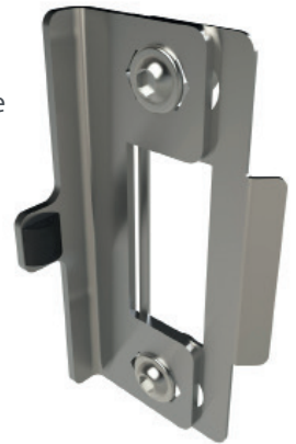
MLK - Mortice Lock Keep (included)