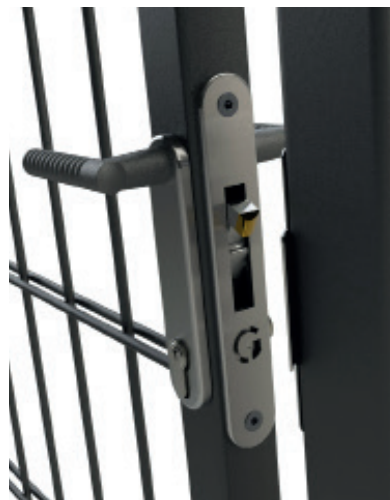
ML4 FC (Full Cover) with ornamental handles